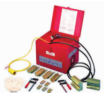
➤ Pipe Freezer