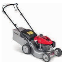
↗ Lawn Mower