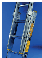
➤ Double Ladder