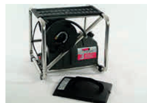
↗ Wallpaper Stripper