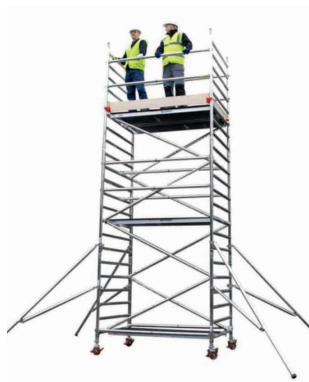
↗ Double Width Tower

Single Width base: 2'3" x 4'9" (700mm x 1500mm)