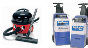
➤ Henry Hoover

*FUEL CHARGES WILL APPLY **SHAMPOO AVAILABLE TO PURCHASE