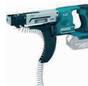
➤ Auto Feed Screw Driver