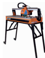
➤ Clipper Slide Tile Cutter