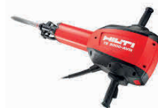
↗ TE3000AVR Hilti