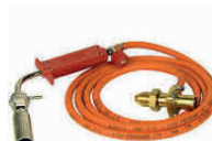
➤ Blow Torch