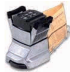
↗ Edge Sander