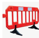
➤ Red Road Barrier