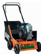
↗ Lawn Scarifier