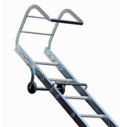
➤ Roof Ladder