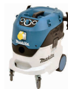
↗ Makita Dust Extractor Unit