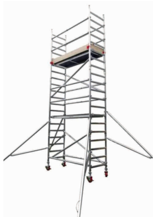
↗ Single Width Tower