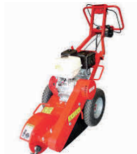
↗ Stump Grinder