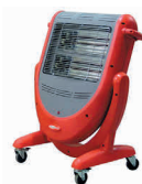
➤ Infra Red Heater