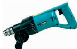
↗ Diamond Core Drill