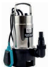
➤ Sub Pump

*FUEL CHARGES WILL APPLY ** WEAR CHARGES WILL APPLY