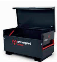
➤ Site Vault