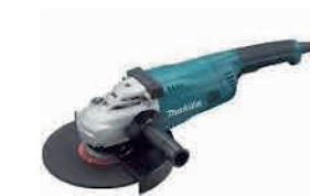
➤ Angle Grinder

All Diamond core bits and blades are non-discountable