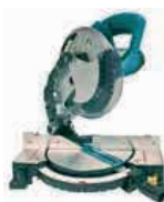
↗ Makita Mitre Saw