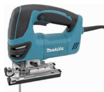
↗ Makita Jigsaw