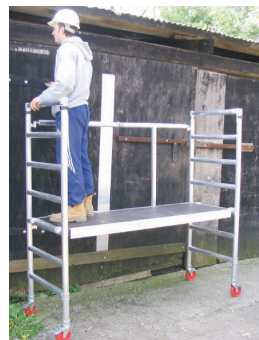
➤ Fold-Easy Tower