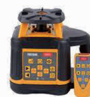
➤ Laser Level