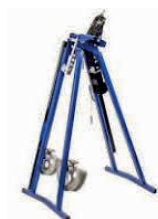
➤ Pipe Bender