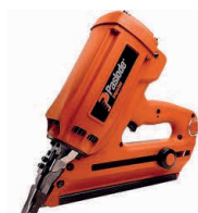
➤ Paslode Nail Gun