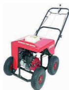
↗ Lawn Aerator