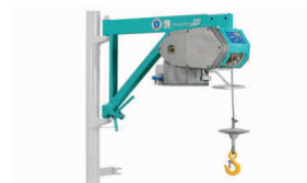
➤ Imer Hoist