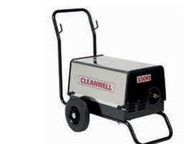
➤ Cherwell Pressure Washer

*FUEL CHARGES WILL APPLY ** WEAR CHARGE WILL BE APPLIED