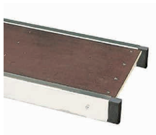
➤ Staging Boards