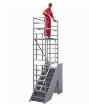
↗ Stairdeck Tower