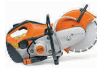
➤ Stihl Saw