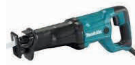
➤ Re-Cip Saw