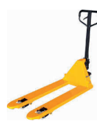
➤ Pallet Truck