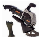
➤ Arbortech Allsaw