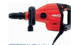
↗ TE700AVR Hilti