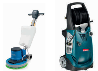
➤ Floor Polisher