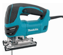
↗ Makita Jigsaw