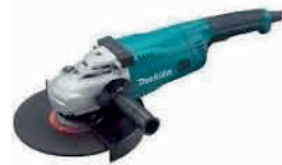
↗ Angle Grinder

All Diamond core bits and blades are non-discountable