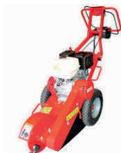
➤ Stump Grinder