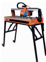
↗ Clipper Slide Tile Cutter