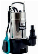
➤ Sub Pump

*FUEL CHARGES WILL APPLY ** WEAR CHARGES WILL APPLY