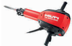
↗ TE3000AVR Hilti