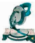
↗ Makita Mitre Saw