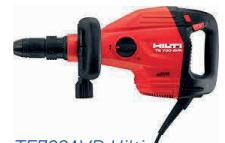
↗ TE700AVR Hilti