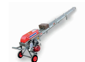
➤ Bumpa Hoist