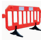
↗ Red Road Barrier