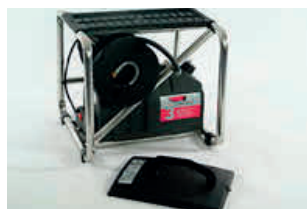
↗ Wallpaper Stripper