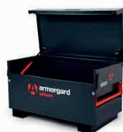
➤ Site Vault