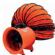
↗ Fume Extractor