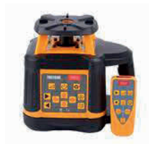
➤ Laser Level