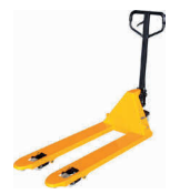
➤ Pallet Truck