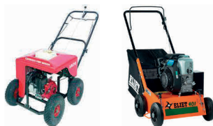
➤ Lawn Aerator ➤ Lawn Scarifier