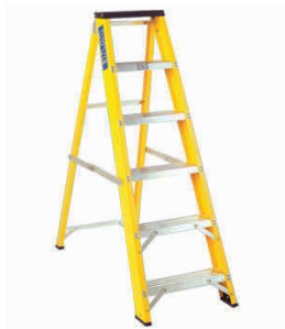
↗ Fibre Glass Steps