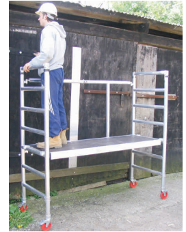
➤ Fold-Easy Tower