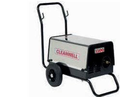
➤ Cherwell Pressure Washer

*FUEL CHARGES WILL APPLY ** WEAR CHARGE WILL BE APPLIED