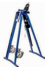
➤ Pipe Bender