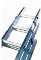
↗ Triple Ladder