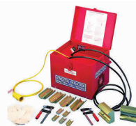
➤ Pipe Freezer