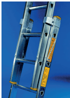
↗ Double Ladder