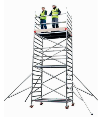
➤ Double Width Tower