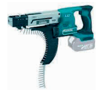
➤ Auto Feed Screw Driver