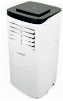
➤ Air Conditioner