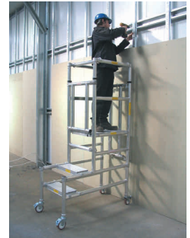
➤ Podium Steps MK1