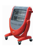
➤ Infra Red Heater