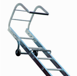
↗ Roof Ladder