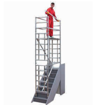
➤ Stairdeck Tower