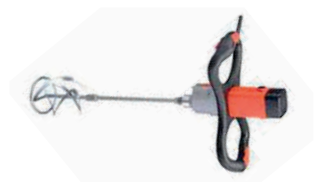
➤ Paddle Mixer