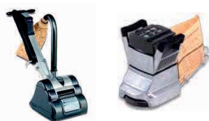
↗ Floor Sander ↗ Edge Sander