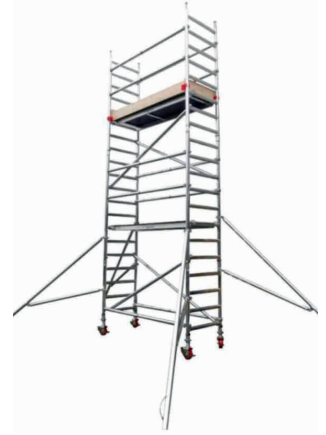
➤ Single Width Tower