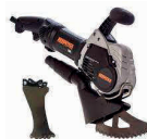
↗ Arbortech Allsaw