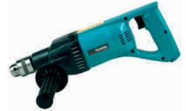
↗ Diamond Core Drill