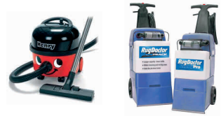
➤ Henry Hoover

*FUEL CHARGES WILL APPLY **SHAMPOO AVAILABLE TO PURCHASE