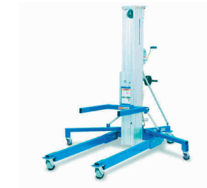
➤ Genie SLA20