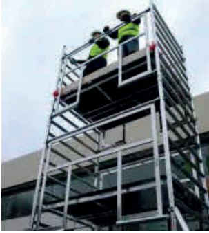
➤ AGR Tower

Single Width base: 2' x 6' (912mm x 1820mm)