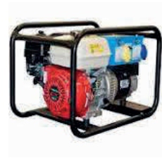
➤ 3kva Generator