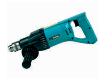
∠ Diamond Core Drill