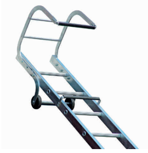
⊼ Roof Ladder