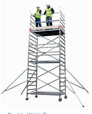
□ Double Width Tower