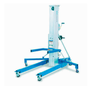
¬ Genie SLA20