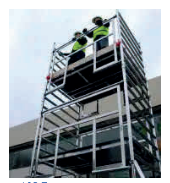
¬ AGR Tower