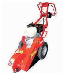
➤ Stump Grinder