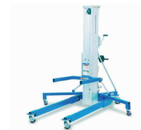
➤ Genie SLA20