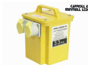
➤ 3kva Transformer