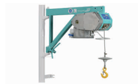
➤ Imer Hoist