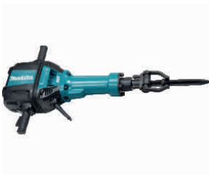
➤ Road Breaker Makita