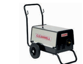
➤ Cherwell Pressure Washer

All fuelled items are full at time of hire, only charged for whatever used.