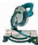
↗ Makita Mitre Saw