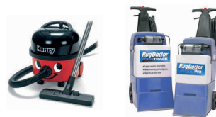
➤ Henry Hoover

*FUEL CHARGES WILL APPLY **SHAMPOO AVAILABLE TO PURCHASE