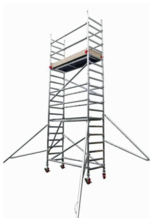
➤ Single Width Tower

Double Width base range from: 4' x 4' (1.4 X 1.4m) 4' x 6' (1.4m x 1.82m) 4' x 8' (1.4m x 2.45m)