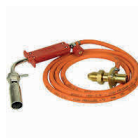
↗ Blow Torch