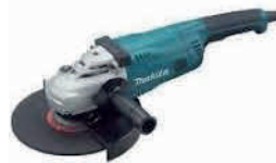
➤ Angle Grinder