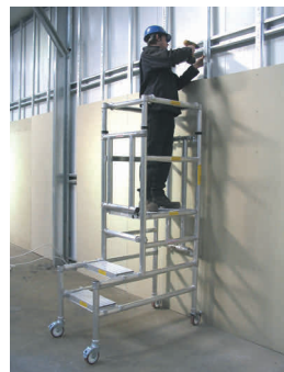
➤ Podium Steps MK1