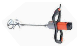
➤ Paddle Mixer

*FUEL CHARGES WILL APPLY ** WEAR CHARGE WILL BE APPLIED