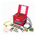
↗ Pipe Freezer