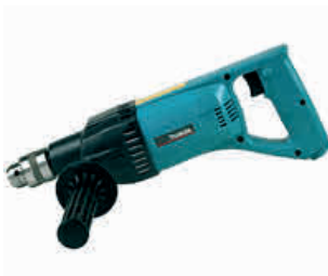
➤ Diamond Core Drill