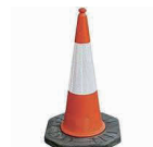
➤ Road Cone