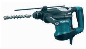
➤ Makita Breaker