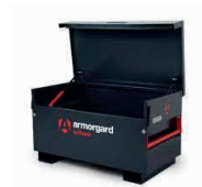
↗ Site Vault