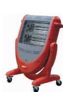
➤ Infra Red Heater