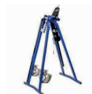
↗ Pipe Bender