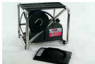
↗ Wallpaper Stripper