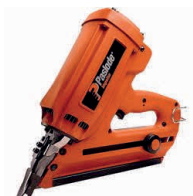
➤ Paslode Nail Gun