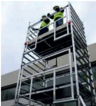
➤ AGR Tower

Single Width base: 2'3" x 4'9" (0.7mtr x 1.5mtr)