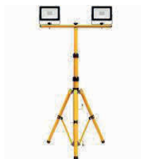
➤ Tripod Lights