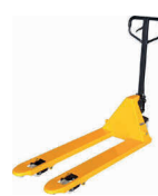
➤ Pallet Truck