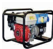
➤ 3kva Generator