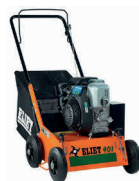
➤ Lawn Scarifier