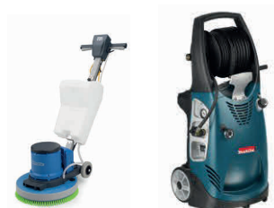
➤ Floor Polisher