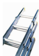
➤ Triple Ladder