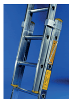
➤ Double Ladder