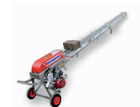
➤ Bumpa Hoist