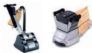
↗ Floor Sander