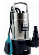
↗ Sub Pump