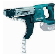
➤ Auto Feed Screw Driver