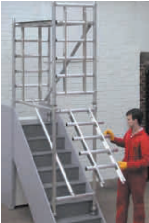
➤ Stairdeck Tower