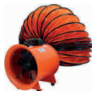
↗ Fume Extractor