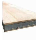
↗ Scaffold Boards