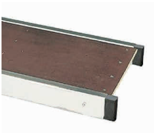
➤ Staging Boards