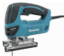
↗ Makita Jigsaw